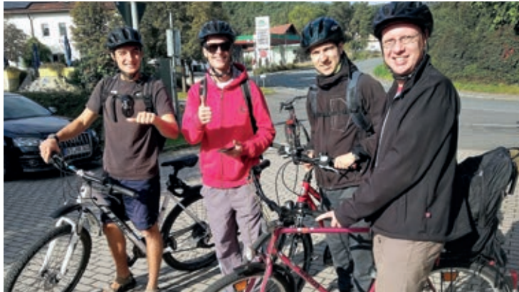
Novices with their novice master

socius shall move into their new home. It is important to have a distinct and separate space for the novices. At the same time, they will be part of the larger group of Jesuits living and working on the Jesuit College campus.