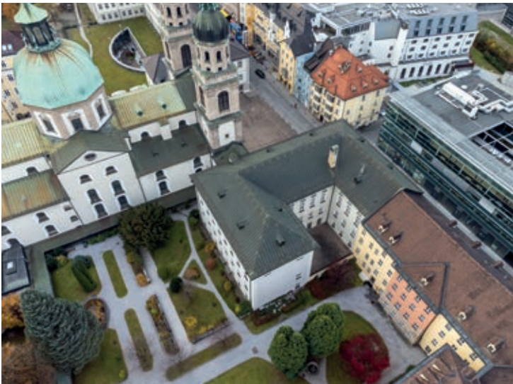
Aerial view of the Jesuit campus in Innsbruck

The Department of Philosophy at Innsbruck's Faculty of Theology is launching a new master's programme in Philosophy, "Philosophy of Religion". The starting date is autumn of 2022.